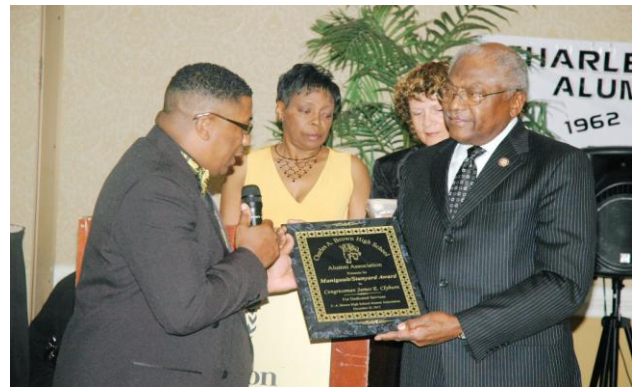
Rep. Clyburn receiving a plaque from CABHAA President